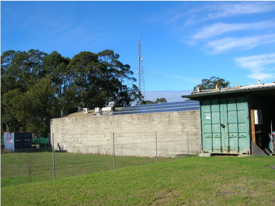
PHOTO 12: from development site looking south-east note radio 2ST antenna tower located approx. 70m from the development site