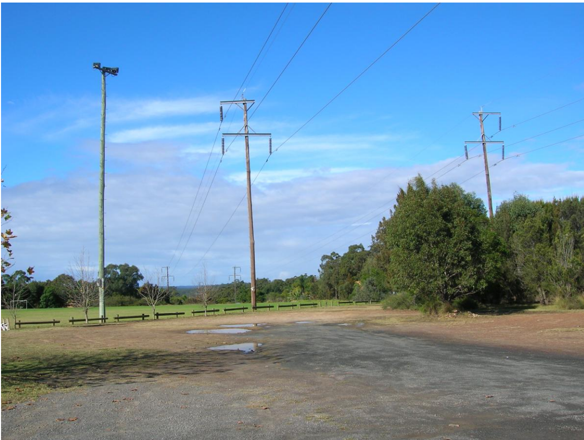
PHOTO 16: from the western end of Drexel Park looking south-east approx. 250 to the development site – note power distribution poles and lighting towers