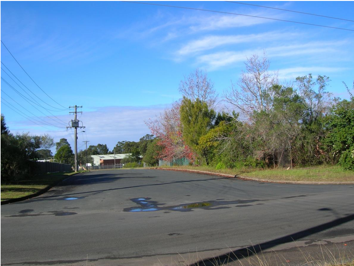
PHOTO 9: western end of Geary Place looking south-east approximately 180m from the development site