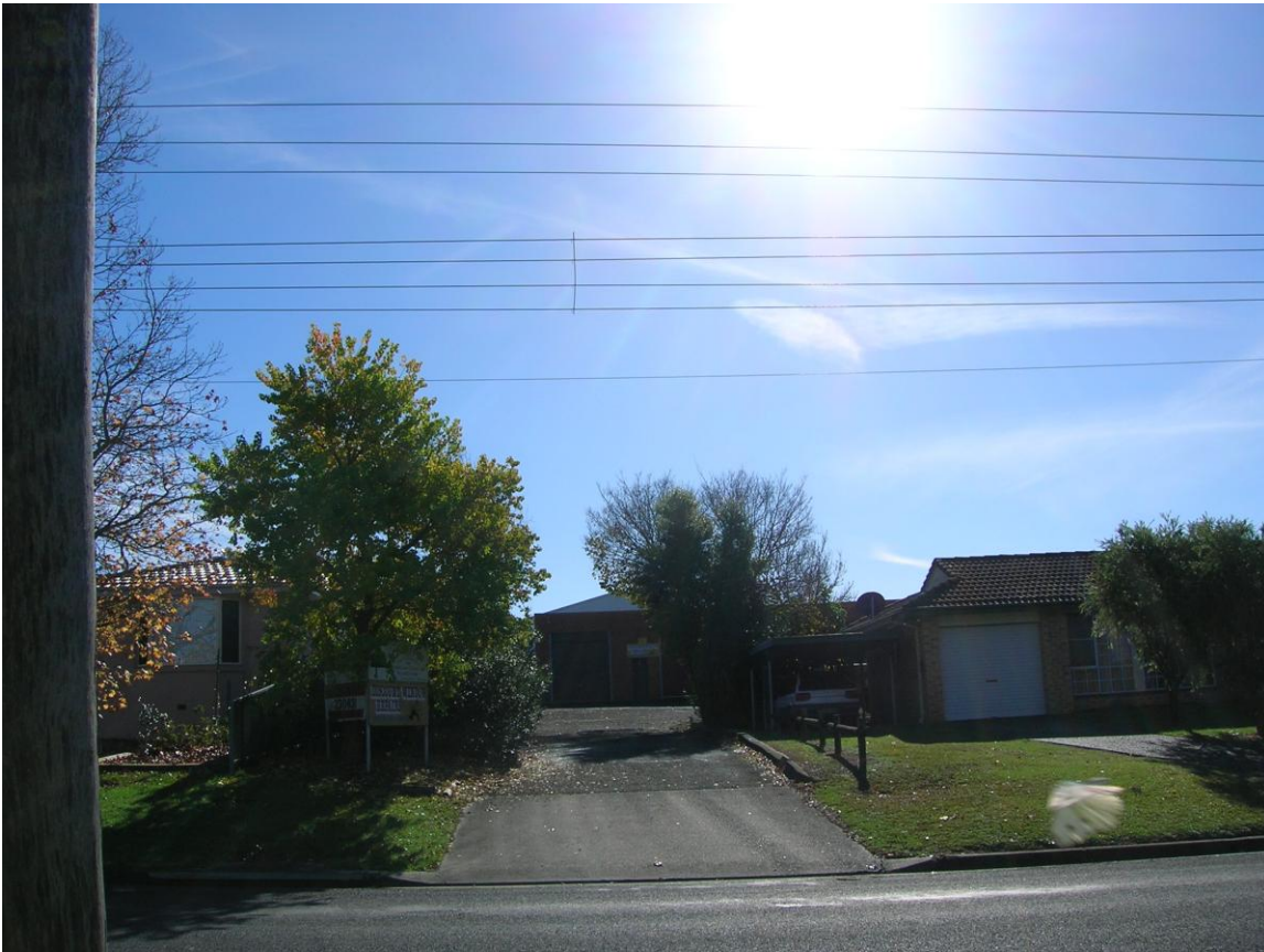
PHOTO 7: southern side of McMahon's Rd looking north approximately 100m from the development site