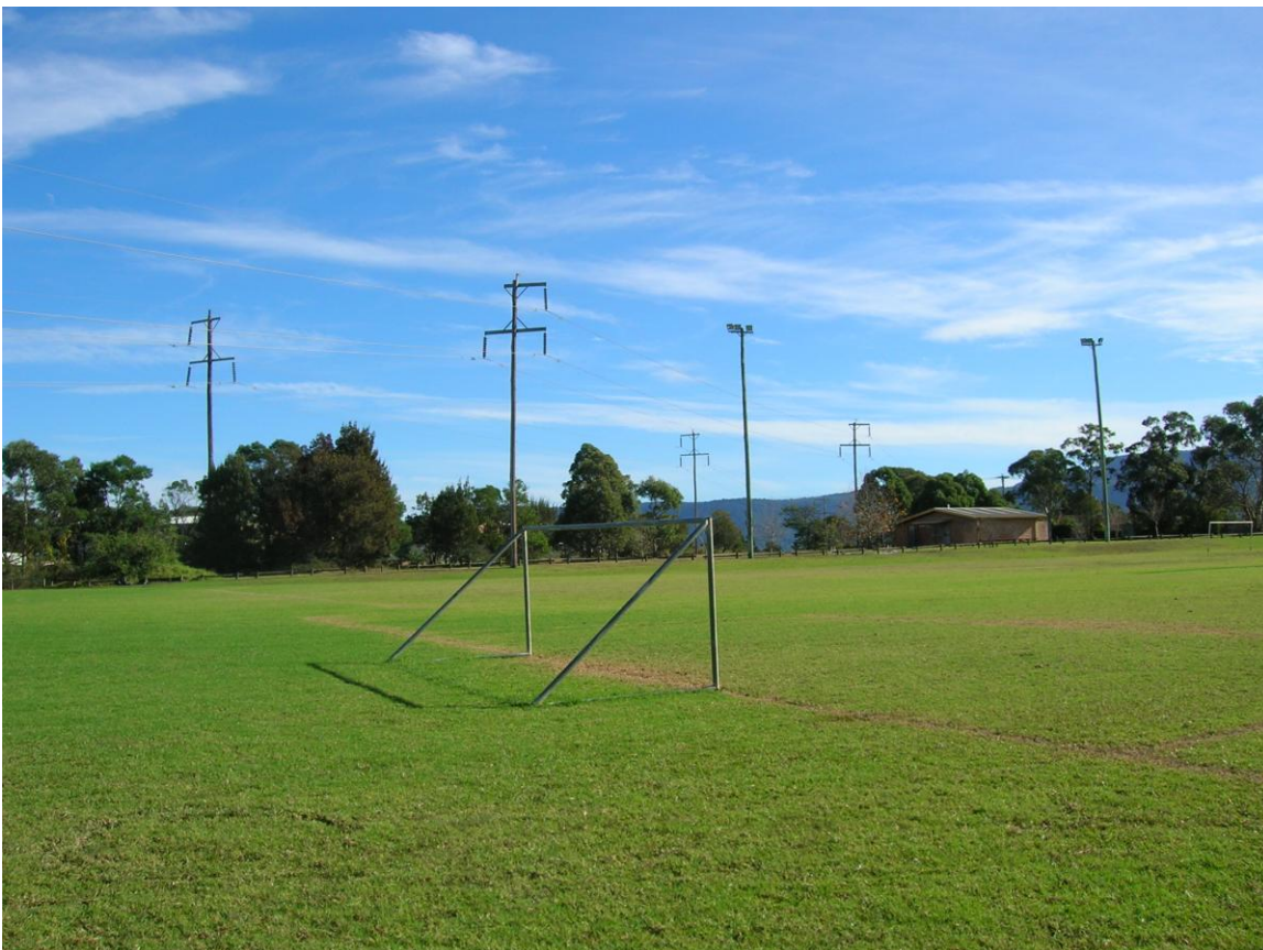
PHOTO 4: western end of Drexel Park looking west approx. 280m from the development site note power distribution poles and lighting towers