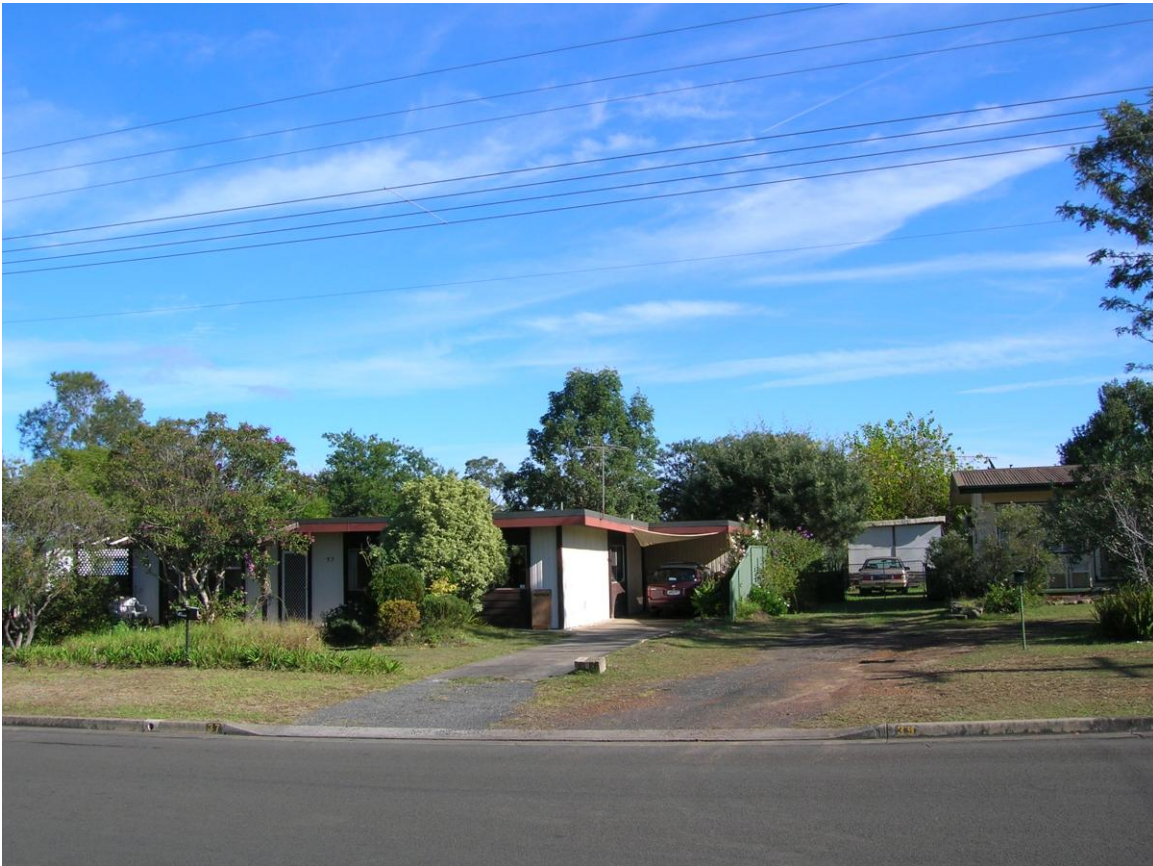
PHOTO 19: cnr Judith and Crawford Drives looking west approx. 550 from the development site