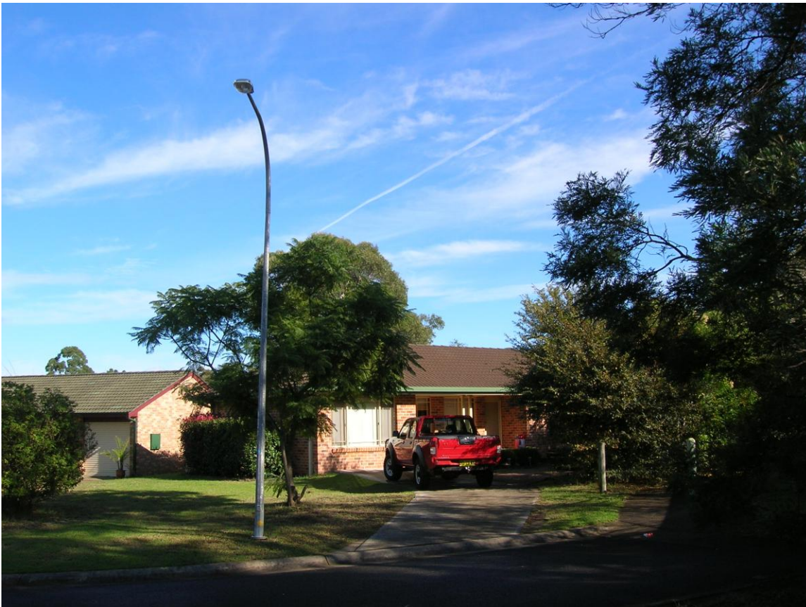
PHOTO 2: northern end of Balmaringa Ave looking s-w-w approximately 480m from the development site