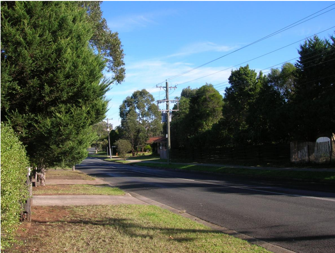
PHOTO 1: cnr McMahons Road and Judith Drive looking n-w-w approximately 550m from the development site - note power poles located on the northern side of McMahons Road