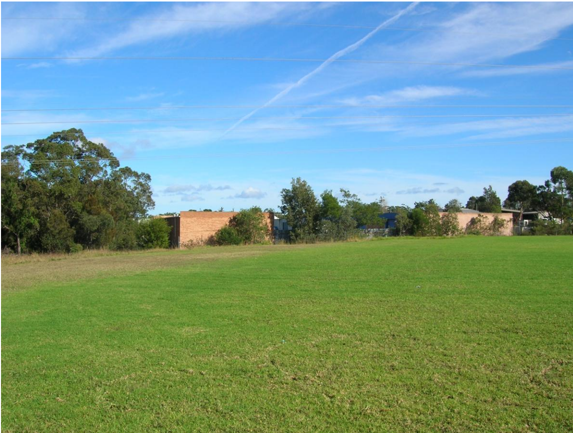
PHOTO 3: western end of Drexel Park looking s-w approximately 280m from the development site note overhead power lines