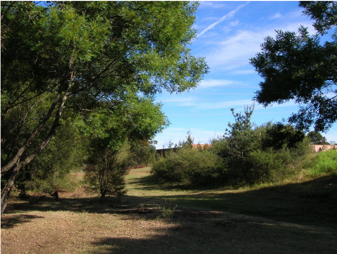
PHOTO 5: northern end of Baramundi looking south-west approximately 280m from the development site