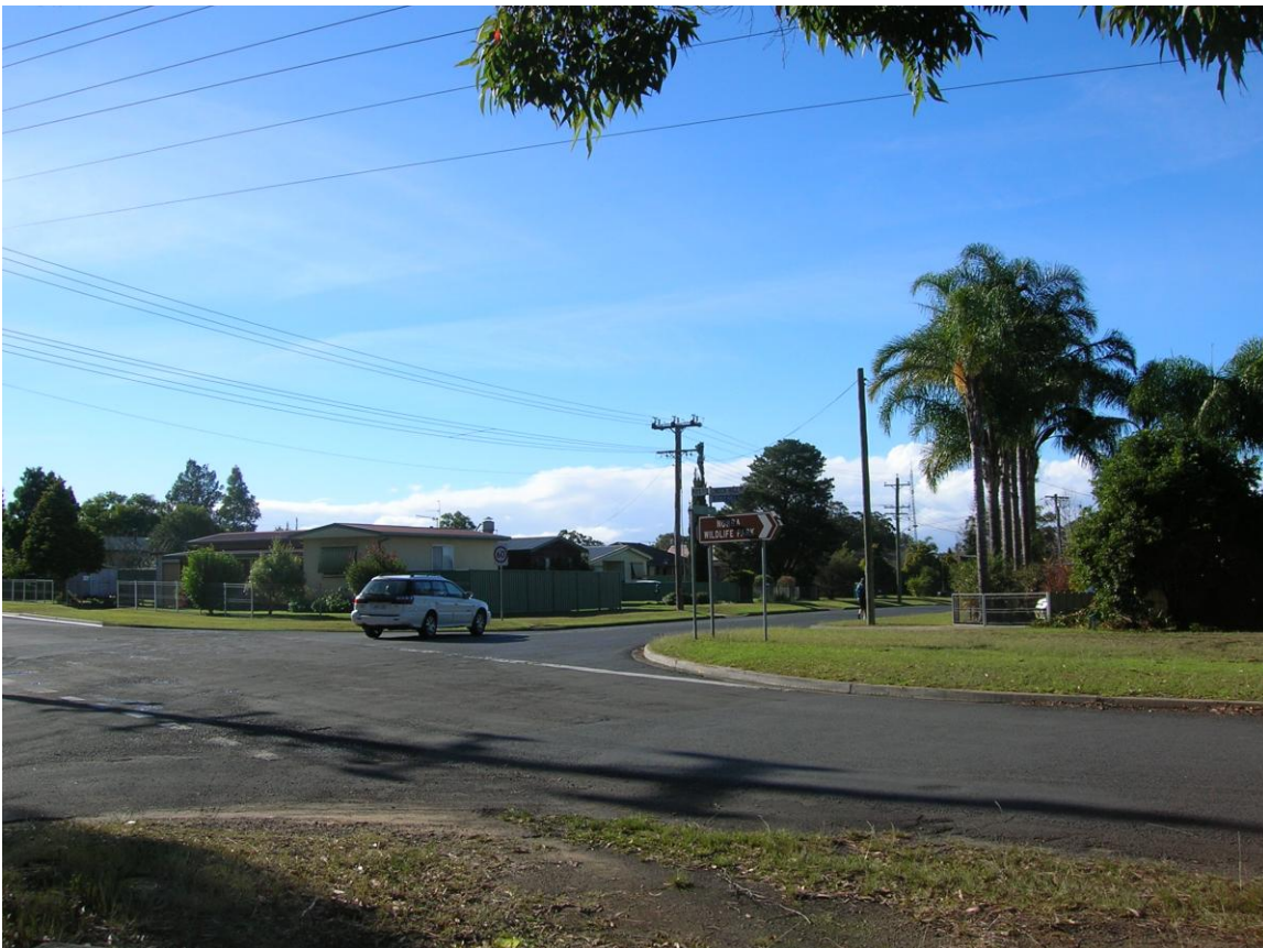
PHOTO 8: cnr of McMahon's and Rock Hill Roads looking north-east approximately 270m from the development site