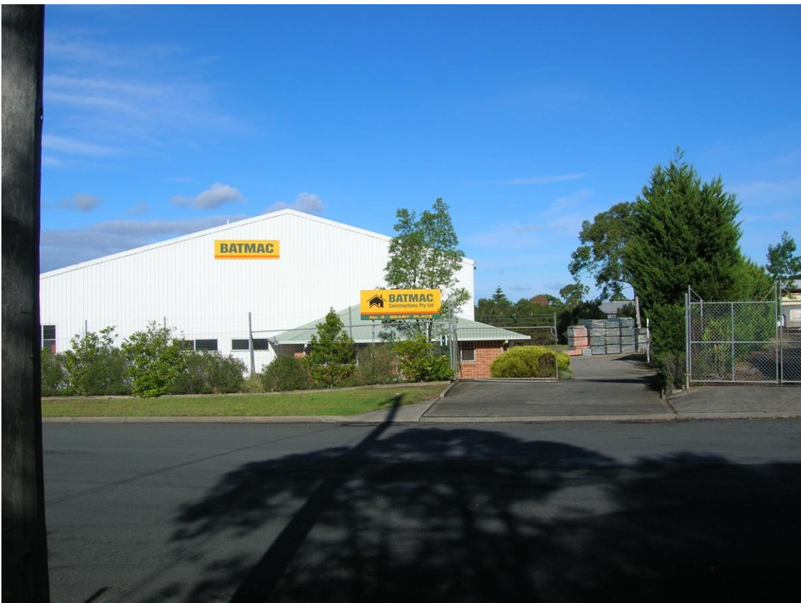
PHOTO 10: northern side of Geary Place looking south opposite and approximately 80m from the development site – note concrete access driveway to the development site