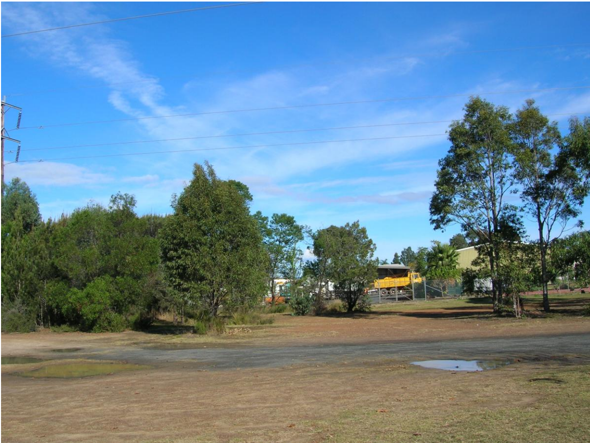
PHOTO 15: from the western end of Drexel Park looking south-west approx. 250 to the development site