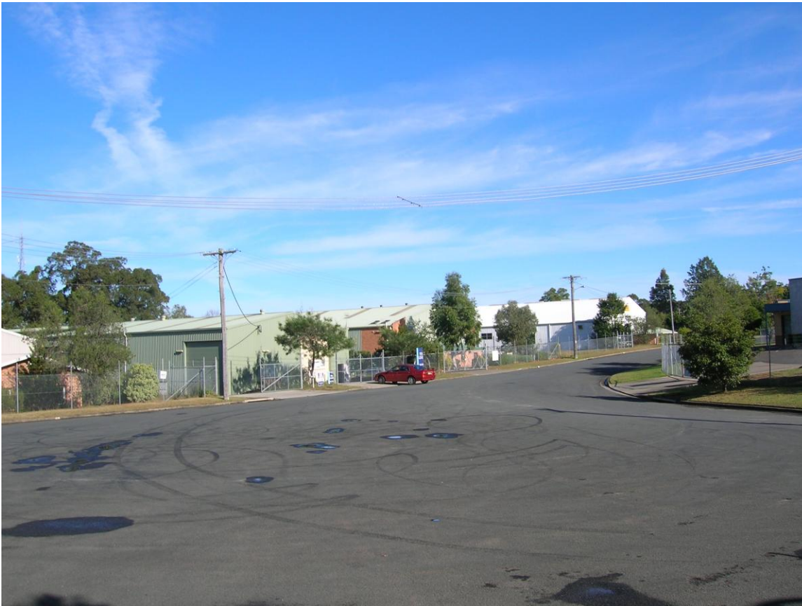
PHOTO 14: eastern end of Geary Place looking west approx. 150 to the development site