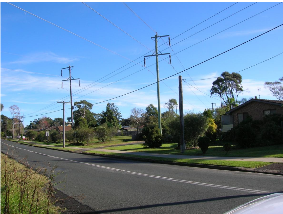
PHOTO 6: southern side of McMahons Rd looking n-w-w approximately 430m from the development site - note power distribution poles and power poles located on the northern side of McMahons Road