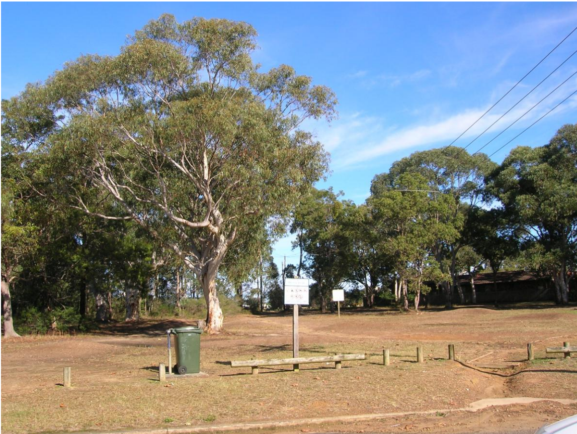
PHOTO 17: from Goolagong Street looking south-west approx. 450 to the development site