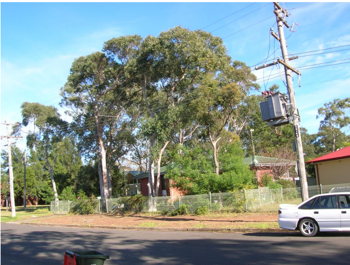
PHOTO 18: cnr Goolagong Street and Judith Dr looking south-west approx. 640 to the development site